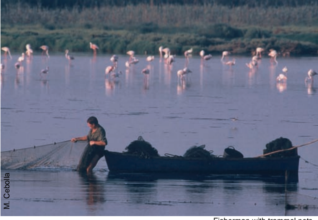
Fisherman with trammel nets