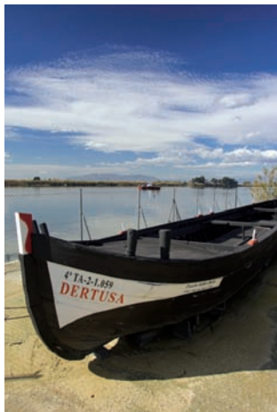
2 Lagut boat

This route travels along country lanes (70%) and cycle tracks (30%). Despite the low density of traffic, pay great attention, particularly at crossroads.