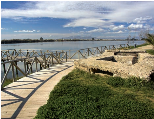
3 Deltebre riverside promenade