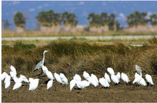
Ducks in the rice paddies on the road of El Toll

Typical fauna: Canal Vell and Garxal: Coot, Mallard, Grey Heron, Cattle Egret, Little Egret, Squacco Heron, Purple Heron, Large Egret, Flamingo, Marsh Harrier, Reed Warbler, Terns and Gulls. Niño Perdido: Kentish Plover, Pratincole, Short-Toed Lark, Crested Lark and Allis Shad.