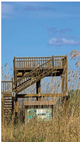
4 Canal Vell viewpoint