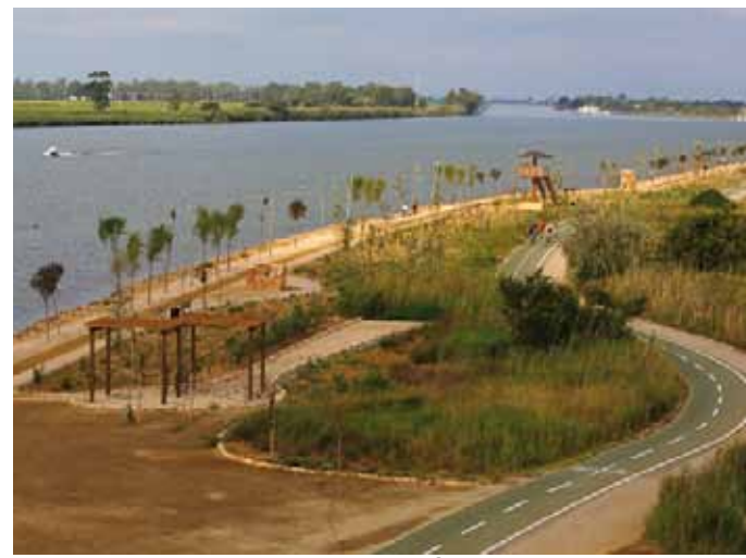
2 Aerial view from the Zigurat

The Garxal, with 280 ha, is the most recently formed of the Delta's ponds. It is constituted by half-moon shaped little islands modeled by the wind and the sea. Along the route you will appreciate that you are surrounded by different ecosystems, mainly sand dunes areas, brackish zones and reed swamp which take in a rich variety of fauna and flora. Take advantage of the two fauna viewpoints of the route (Km 1,6 and Km 2,3) to observe the fauna of the pond.