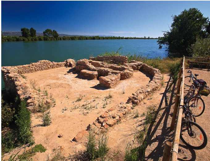
2 The Sínia

Currently, you can see two llaguts in the delta: one is on display at the Ecomuseum and the other in front of the Club Nàutic Deltebre. A third llagut, Lo Sirgador, does runs for tourists from Amposta to Miravet.