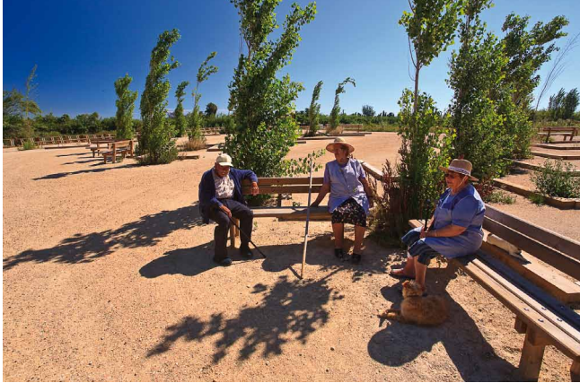
3 Carpark 7