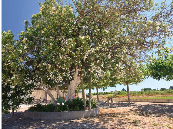
4 Balada's Oleander. Monumental Tree