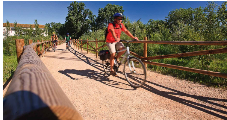
1 Camí de Sirga start