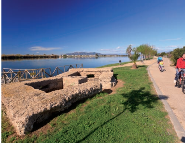
7 Machine gun post

Typical fauna: Kingfisher, black-crowned night heron, little egret, cattle egret, robin, cormorant, moorhen, sandpiper, whiskered tern, black-headed gull, collared dove, greenfinch.