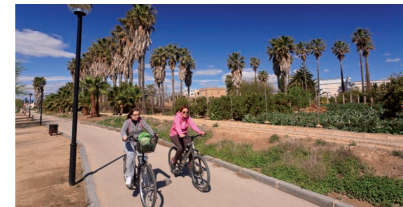
2 The Belgians'House