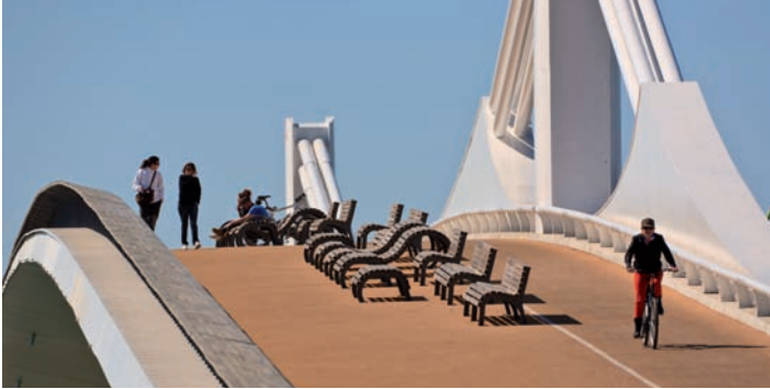
4 Lo Passador Bridge

people stopped using the barcaassa (lighter) to cross the river, once the Lo Passador Bridge was opened.