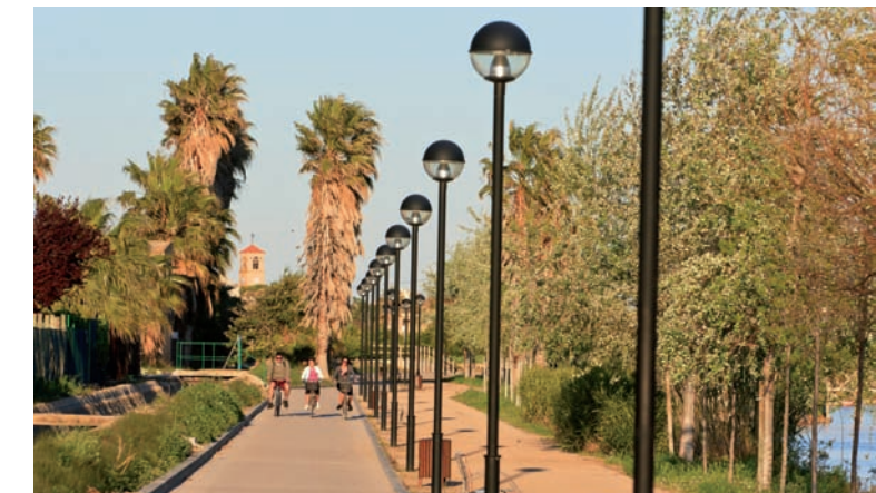
1 Jesús i Maria church tower