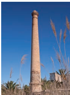
9 El Maset