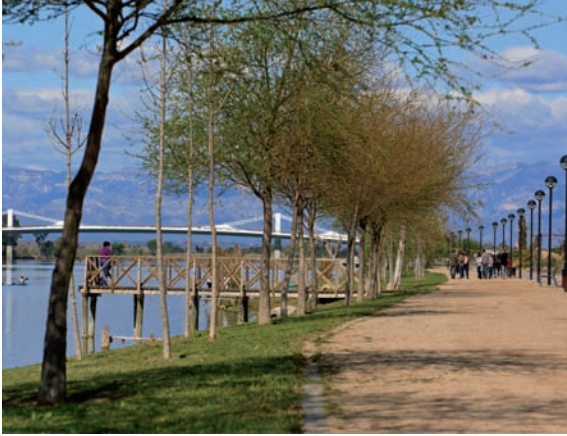
5 Riverside walk